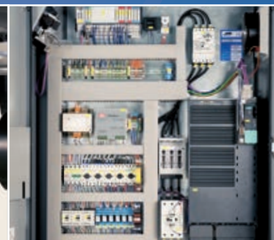
Control box with electric components and frequency controller.