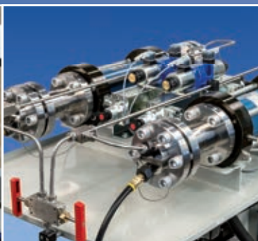
Stand-by intensifier available as an option.