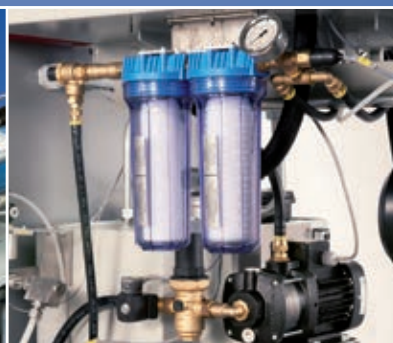
Feed water supply with booster pump and double filter unit.