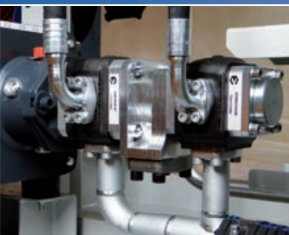
Highly dynamic, frequency-controlled hydraulic unit with servo drive and internal gear pump, dual version for higher flow rate.